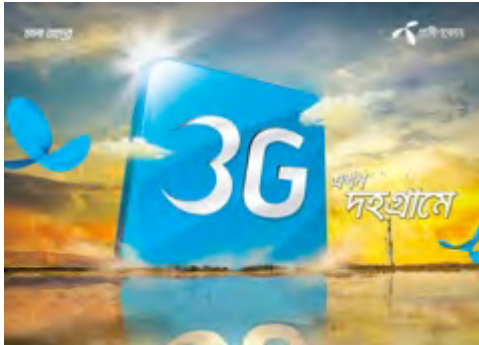
Non GP_ varieties campaign