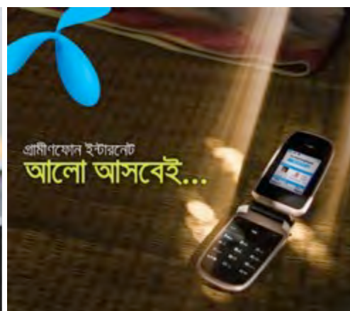
GP_Mobile backup / Press & magazine Ads & poster