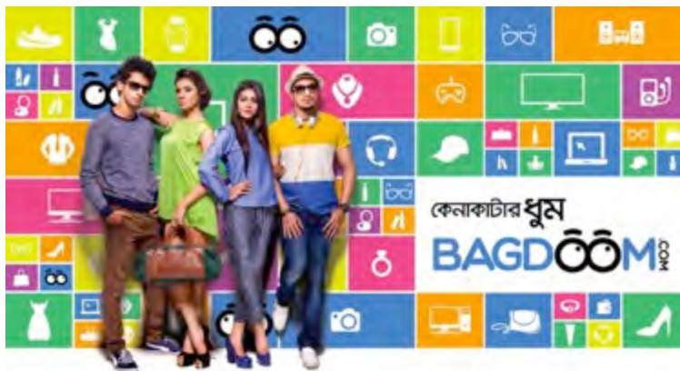
Non GP_ varieties campaign